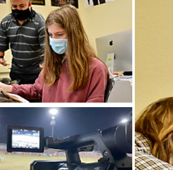
Students attend Local TV News Stations as a part of their field trips.