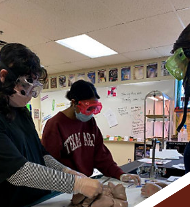
Students participate in FFA (Future Farmers of America), they also develop skills for leadership and career success. Completion of Agriscience 1 and 2 will provide one credit of laboratory science for Universities.